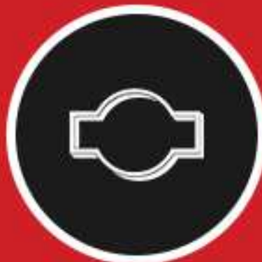
Trim & Form