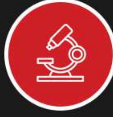
Medical Devices Industries