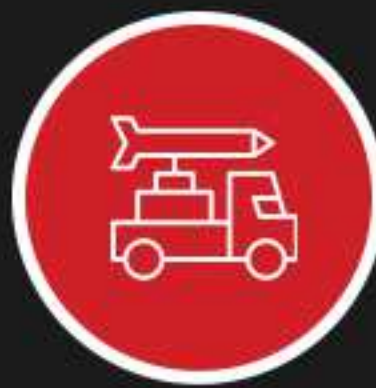
Military Defense Industries