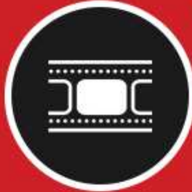
Tape & Reel Packaging