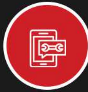
Cell Phones Industries